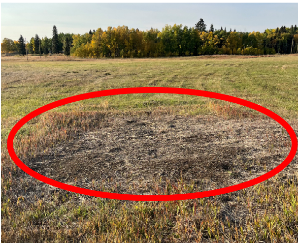
Above - Hay field showing dead grass area and extreme arid soil - indicating gas leak area

Meota discovered a gas leak in September in the north eastern part of our franchise area. If you see any areas on your lands that appear as extremely dry soil, dead growth areas, dead flies/insects accompanied by a gas odour smell, please call us so that we can investigate.