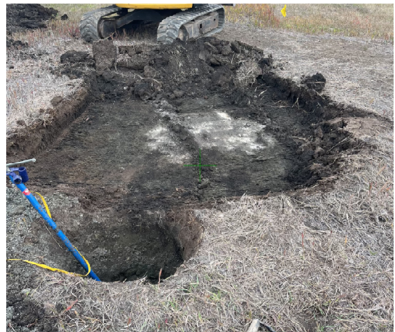
Above - Excavation of gas leak area – white area indicating gas leak